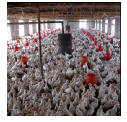
Use Description: Providing feeding areas, structures, and other facilities for poultry production.

How do you feel about this as a future use at the Depot? (check one):