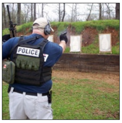
Use Description: Facilities and land areas dedicated for the training of local, state, and/or federal law enforcement officials.