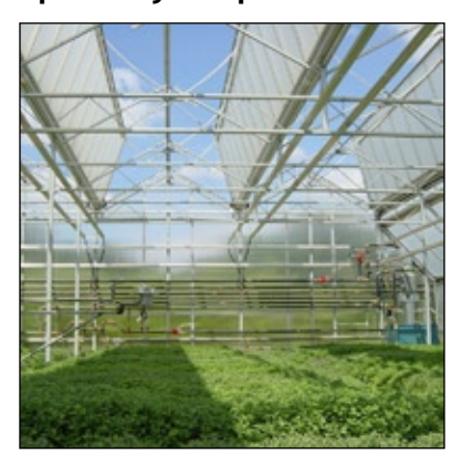
Use Description: Niche agricultural products such as organic produce, mushrooms, floriculture, etc. grown in fields or inside greenhouses or other facilities.

How do you feel about this as a future use at the Depot? ( check one ):