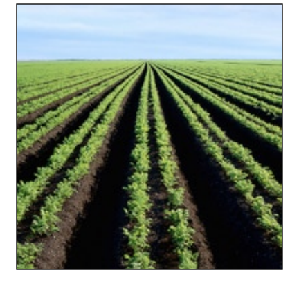
Use Description: Planting and harvesting of crops such as corn, soybeans, hay, etc.

How do you feel about this as a future use at the Depot? (check one):