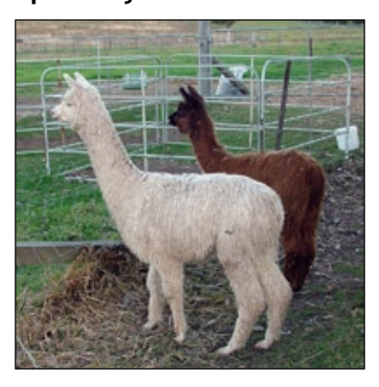
Use Description: Providing grazing, feeding areas, structures, and other facilities for specialty livestock, such as alpacas, ostriches, etc.

How do you feel about this as a future use at the Depot? (check one):