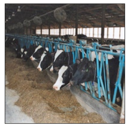
Use Description: Providing grazing areas, confined feeding areas, structures, and other facilities for dairy cattle, sheet or goats for milk and other dairy products production.